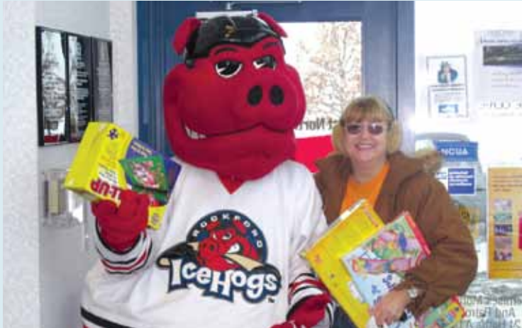
Hammy the Ice Hog and a generous Rockfordian donating toys.